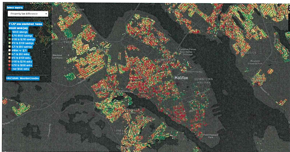
Figure 1: Halifax Area CAP Map

Two tax bills are then calculated for each property in the data set: one as a tax bill under the CAP program, and one as a tax bill with no CAP. The difference between these tax bills is represented by shades of colour and is plotted on a GIS map using the GPS coordinates in the PVSC data set.