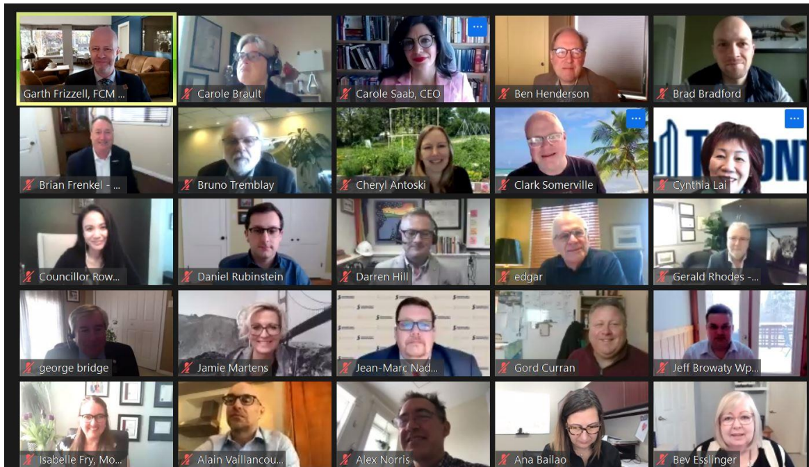
Governance in the COVID era: FCM’s Board of Directors meets safely online.